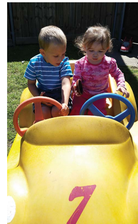
Mother's Day Out is an opportunity for children to learn skills necessary for beginning school.

"Everything they'll gain from coming there will benefit them down the road — socializing with other kids, learning to adjust to other adults and new people in their lives," she adds. "That's our end goal, to get them